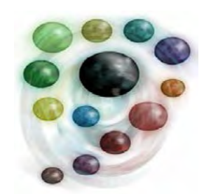
Pic. 4. Maerlyn's Rainbow

For example, in his most popular book series entitled The Dark Tower. This piece of art in the science-fiction genre (which also includes horror) gives examples of many colours depicting different things. All of the 13 colours occurring there create the Wizard's Rainbow. Colours such as black, pink, orange, purple, yellow, green, blue, crimson, indigo, azure or grey can be identified in it. Each of them is attached to a special meaning. For example, the Black Bend, also called the Black Thirteen, is the symbol of evil forces, for it is used by the story's main antagonist, the Crimson King, 'to monitor the events of Mid-World' [9]. Other colours represented luck, telepathy, love, power, courage, purity and other important elements of the story. S. King also created an antagonist called the Crimson King, and the two opposite powers called the Red and the White. It is obvious then that S. King attaches great importance to colour images.