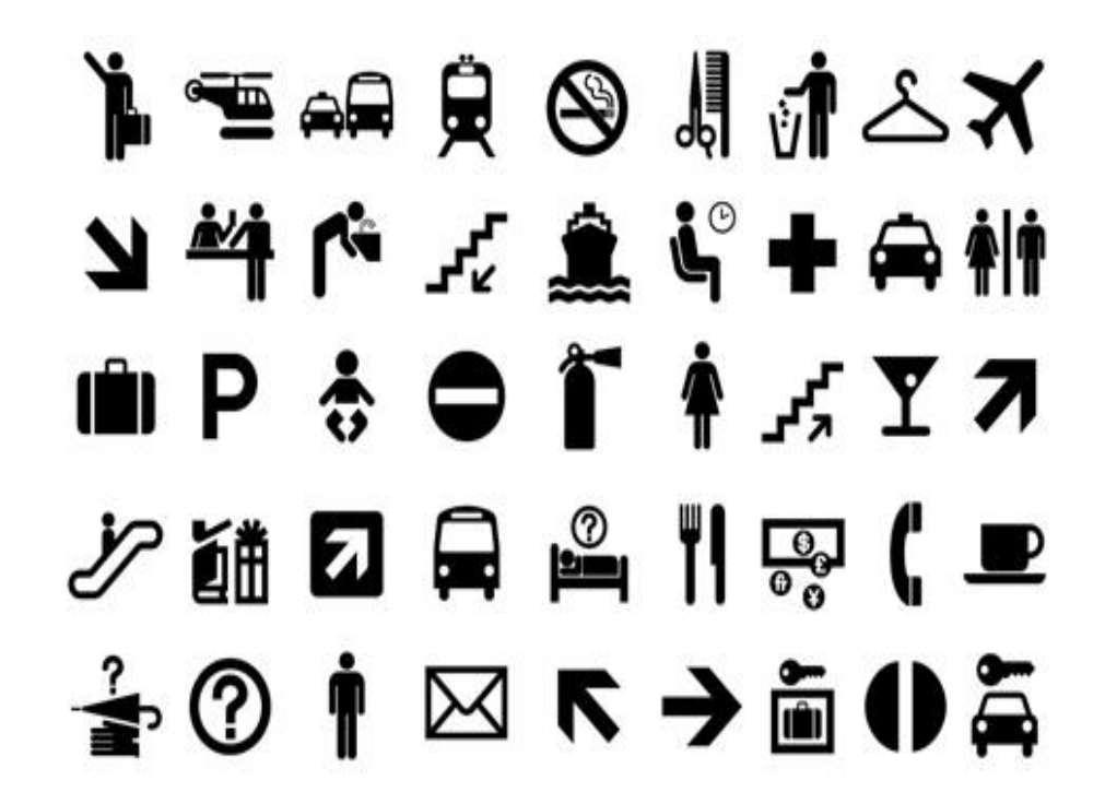
Pic. 1. Universal Symbols

Among the main tasks of our research are the following: to analyse types of symbols used by Stephen King and their meaning in the novels under analysis.