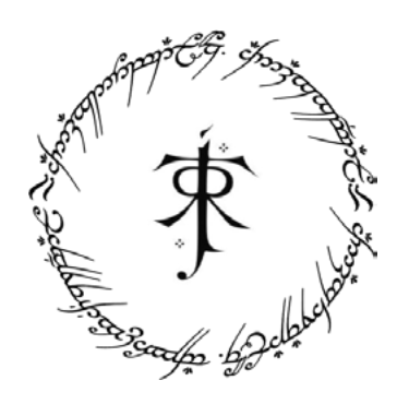
Pic. 3. The Runes of the Ring and the Tolkien's Symbol

It's interesting to know that this symbol was created especially for this popular book series and depicts three powerful objects: the Elder Wand, the Resurrection Stone and the Cloak of Invisibility. The image has become so popular that many people decided to tattoo it. Another popular graphical symbol is the Tolkien's symbol connected with the runes of the Ring. The novel "The Lord of the Ring" is full of symbolism, but the runes of the Ring are so recognizable, that people engrave it on their wedding rings. This also shows what a huge impact literary symbols can have on readers.